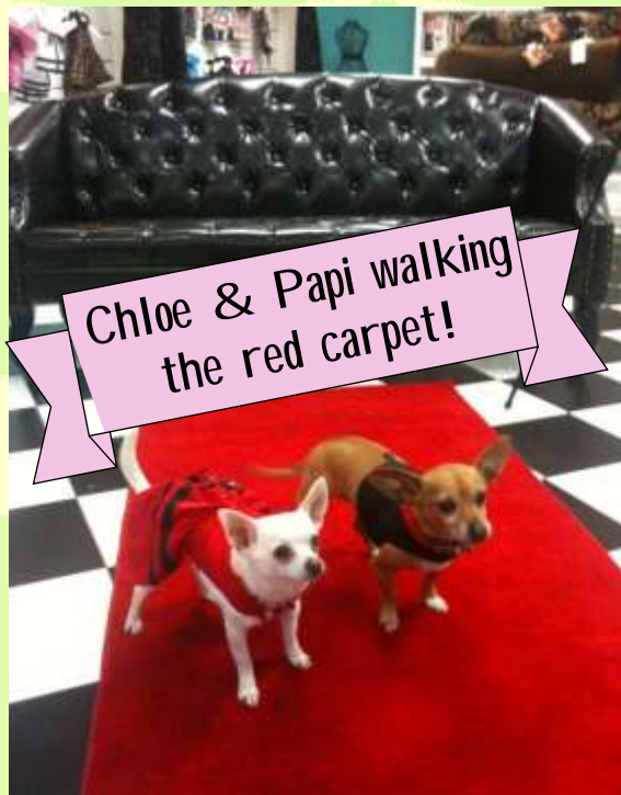
Chloe & Papi walking the red carpet!

See more pictures of Chloe & Papi's visit on our Facebook's Album.