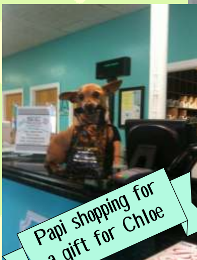
Papi shopping for a gift for Chloe