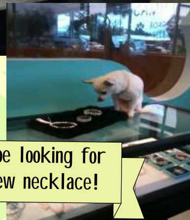
Chloe looking for a new necklace!