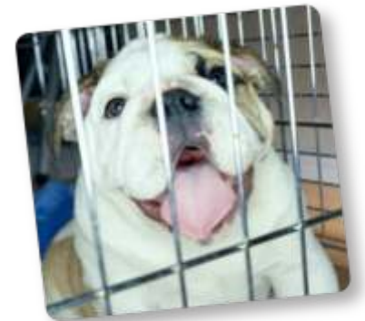
Bark Buster, "How Can You Be a More Responsible Dog Owner?". February 9, 2011.

Watch for temperature extremes. Many dogs love tagging along for car trips, but never leave your dog in the car if it's extremely hot or cold outside. Your car is like an oven under the blazing sun and a freezer in the bitter cold.